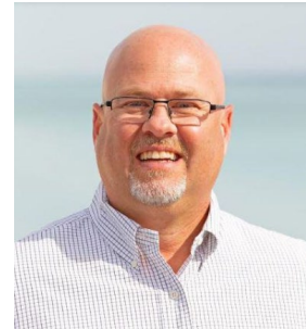
Mayor Mark Sheldon City of Panama City Beach