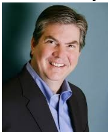
Bay County Tourist Development Council