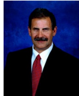
Mayor Greg Brudnicki Panama City